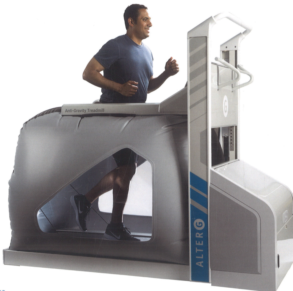
FIT 100 Anti-Gravity Treadmill®

"Instead of worrying about falling, patients concentrate on walking and coordination. Not only does the AlterG strengthen muscles, it builds confidence."