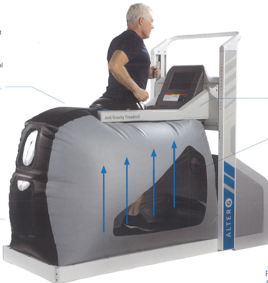
FIT 100 Anti-Gravity Treadmill®

The Fit uses AlterG's patented DAP technology to reduce gravitational forces and provide a fall-safe environment, while supporting unimpeded gait mechanics and balance.